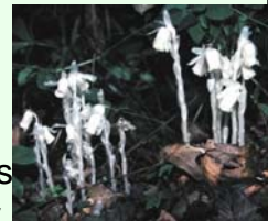
Indian pipe, an unusual woodland species