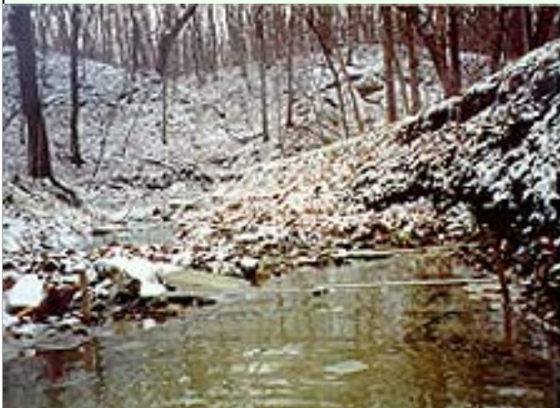
Headwater stream at Breidenthal Biological Reserve